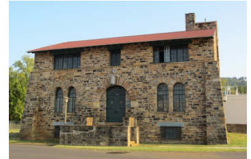
The renovated head house from the original 1936 plant construction serves as a landmark for the expanded and modernized Lake Fort Smith Water Treatment Plant.

The Lake Fort Smith Water Treatment Plant improvements will aid Fort Smith Utility in providing safe, reliable drinking water to the region for years to come. For more information, e-mail us at info@fortsmithwater.org .